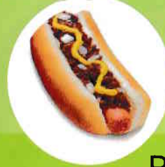
Hot dog Special

*Contains raw or undercooked ingredients. Consuming raw or undercooked meats, poultry, seafood, shellfish, or eggs may increase your risk of foodborne illness