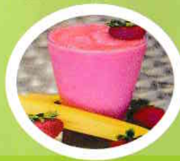
Strawberry Banana smoothie

*Contains raw or undercooked ingredients. Consuming raw or undercooked meats, poultry, seafood, shellfish, or eggs may increase your risk of foodborne illness