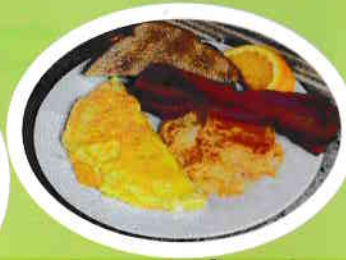
2 Eggs Special